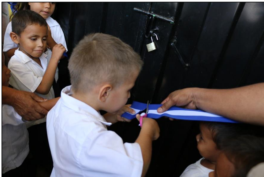
Student cutting the ribbon for the opening of the new school in Nacaome, San Rafael, Honduras