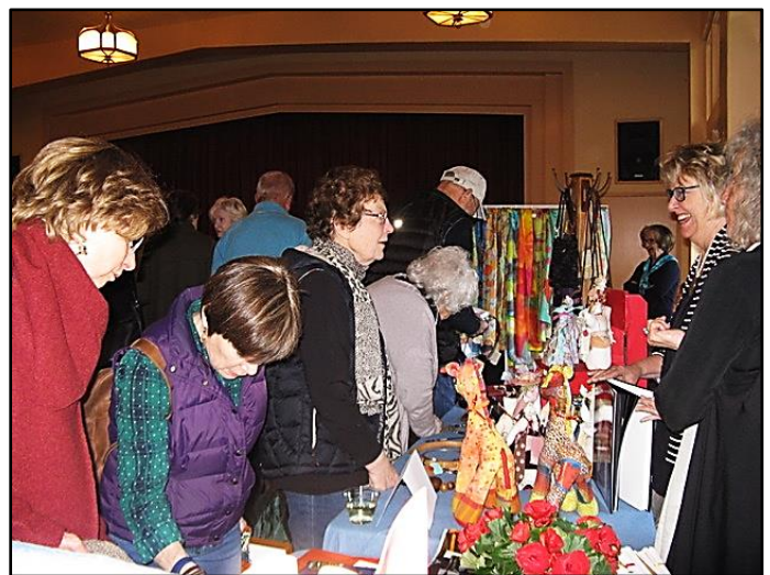
Art Party